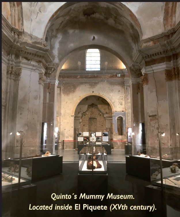
Quinto's Mummy Museum. Located inside El Piquete (XVth century).

It was in the last restoration stages when a serie of burial sites inside the church which had perfectly remained in natural state , was discovered. Thus a phenomenon, which goes down all over the country, is known as the mummies of Quinto .